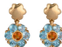
18ct Yellow Gold Blue Topaz & Citrine flower Stud Earrings $1,495