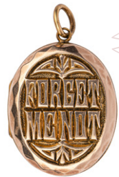
Victorian 9ct Rose Gold Oval Locket with Forget Me Not $1,495