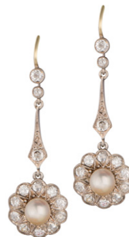
Victorian Diamond & Pearl Daisy Drop Earrings $7,600