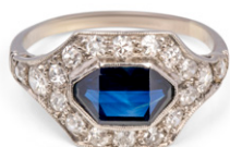
Art Deco Platinum Fancy Cut Sapphire and Diamond Ring $9,900