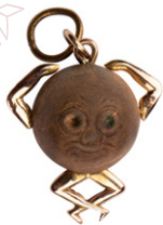
9ct Yellow Gold Touchwood Charm Circa 1915 $750