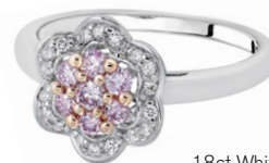
18ct White & Rose Gold Australian Pink Argyle & White Diamond Daisy Ring $12,950