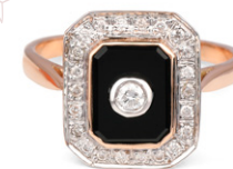
9ct Rose Gold rectangular Onyx & Diamond halo Ring in Art Deco style $1,850