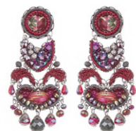
Crimson Flame Classic Large Wide Earrings $295