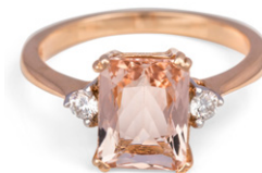
9ct Rose Gold Morganite & Diamond Ring $2,395