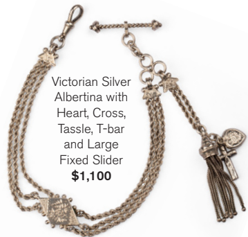
Victorian Silver Albertina with Heart, Cross, Tassel, T-bar and Large Fixed Slider $1,100