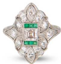
Art Deco Platinum Emerald and Diamond Plaque Ring $12,300