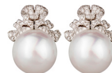
18ct White Gold South Sea pearl with diamond set ribbon detail $10,960