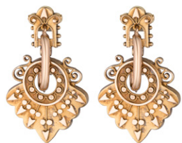
Victorian 15ct Yellow Gold Articulated Drop Earrings With Ornate Design $4,800