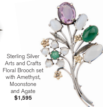
Sterling Silver Arts and Crafts Floral Brooch set with Amethyst, Moonstone and Agate $1,595