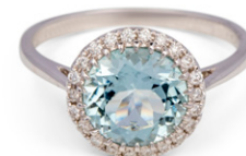
18ct White Gold Round Aquamarine and Diamond Halo Ring $2,750