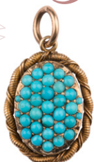
Georgian 15ct Yellow Gold Turquoise Beaded Locket with rope twist border detail $1,100