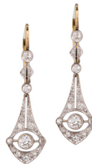
Art Deco 18ct Yellow & White Gold Diamond Drop Earrings $7,750