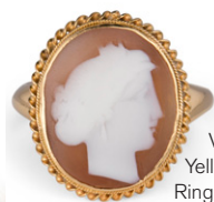
Victorian 18ct Yellow Gold Cameo Ring with twisted wire surround $1,895