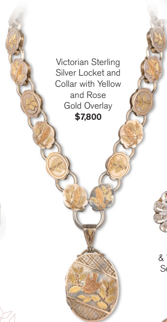
Victorian Sterling Silver Locket and Collar with Yellow and Rose Gold Overlay $7,800