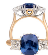
18ct Yellow and White Gold Handmade Cushion Cut Ceylon Sapphire and Diamond Ring $25,700