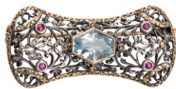
Art Deco Aquamarine, Ruby & Diamond Filigree Brooch $3,100