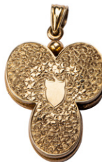
Victorian 14ct Yellow Gold Clover Shaped 12 Segment Trifold Locket Circa 1870 $5,995