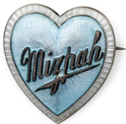
Sterling Silver Pale Blue Enamel Mizpah Brooch. Hallmarked John Aitken and Sons Birmingham 1915 $995