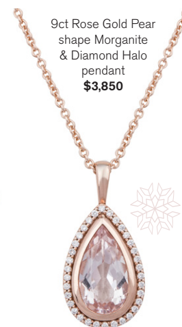
9ct Rose Gold Pear shape Morganite & Diamond Halo pendant $3,850