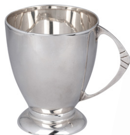
Late Art Deco Sterling Silver Christening Cup Birmingham 1947 $495