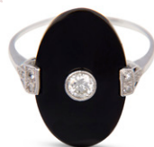
Art Deco 18ct White Gold Oval Onyx and Diamond Ring $6,100