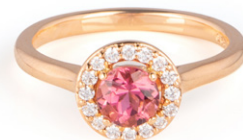
18ct Rose Gold Pink Tourmaline & Diamond Ring $2,480