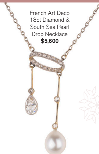
French Art Deco 18ct Diamond & South Sea Pearl Drop Necklace $5,600