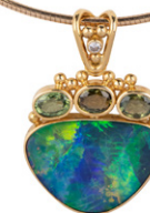
14ct Yellow Gold Opal Doublet, Sapphire and Diamond Pendant $7,045