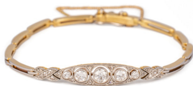
Art Deco 18ct Yellow Gold & Platinum Diamond Set Bracelet $8,500