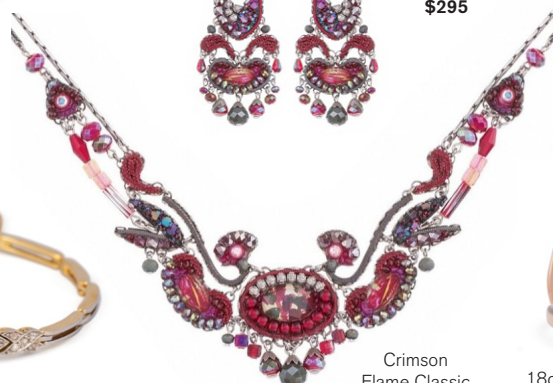
Crimson Flame Classic Medium Necklace $425