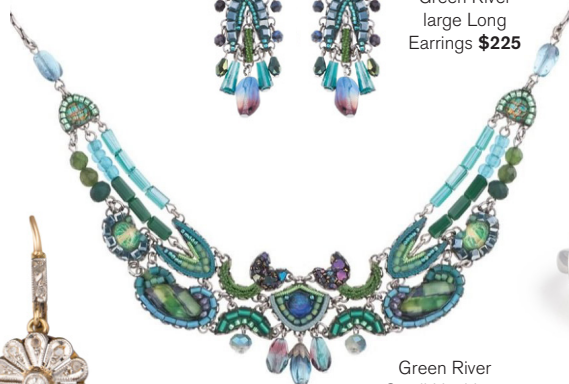
Green River large Long Earrings $225