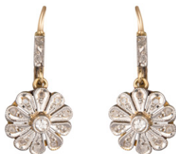
Victorian 18ct Yellow & White Gold Drop Diamond Set Flower Design Earrings On Continental Clip Hooks $3,600