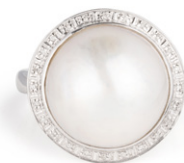
9ct white gold Mabe Pearl and Diamond Ring $1,175