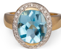
9ct Yellow Gold Oval Blue Topaz and Diamond Ring $1,850